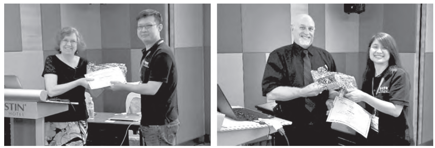
Souvenir presentation to speakers as token of appreciation.

Kuala Lumpur scheduled respectively on September 26th and 27th. Approximately 120+ attendees- a diverse group of professionals from 30+ companies and local universities Malaysia wide, have gathered face-to-face in this bi-annual technical workshop at both venues.