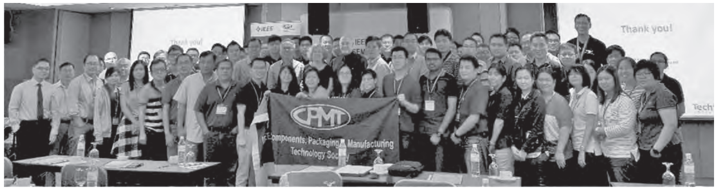
Attendees at Eastin Hotel, Penang.