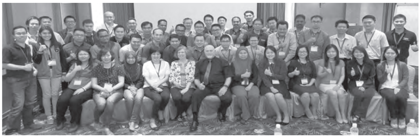
Attendees at Sunway Resort Hotel, Kuala Lumpur.